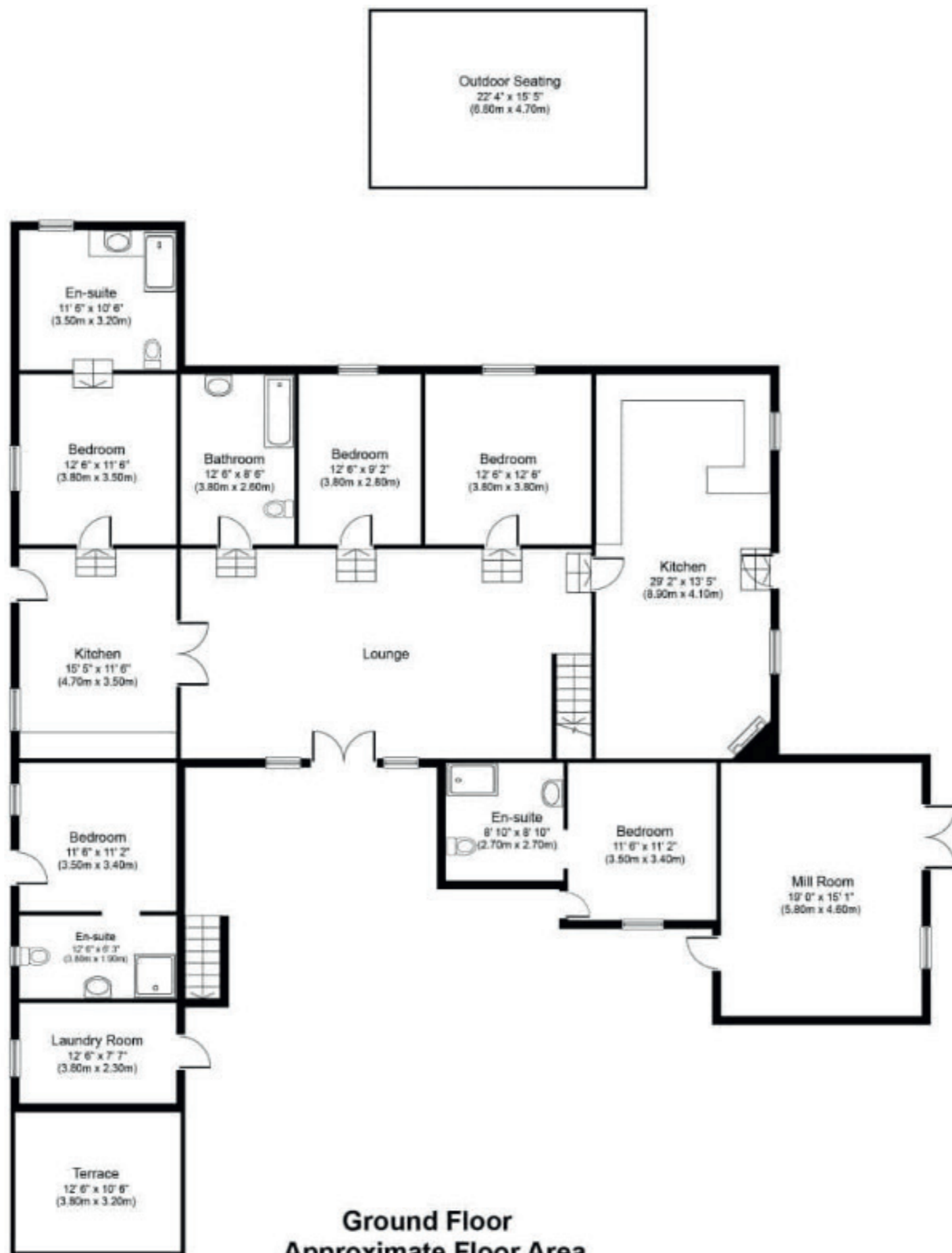
Ground Floor Approximate Floor Area (Including Outdoor Seating) 2949 sq. ft. (274.0 sq. m.)